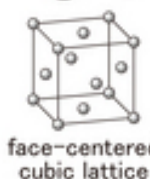
face-centered cubic lattice

Note1. Each figure below shows center position of iron atom.