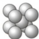
alpha iron delta iron