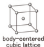
body-centered cubic lattice