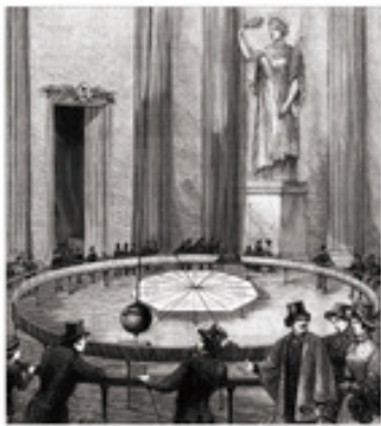
The first experiment of Foucault pendulum at the dome of the Panthéon in 1851, Paris.