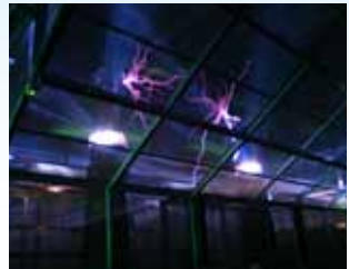
① Electrical discharge simulator