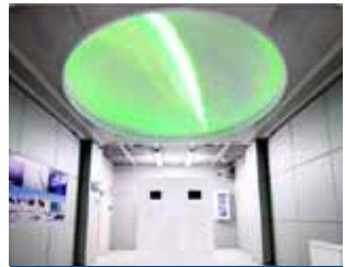
③ -30°C room