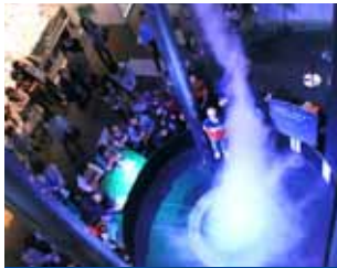
④ Man-made, 9-m-tall tornado