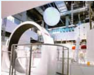
② Large water circulation simulator