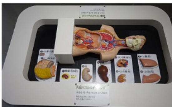
The numbers are hints.