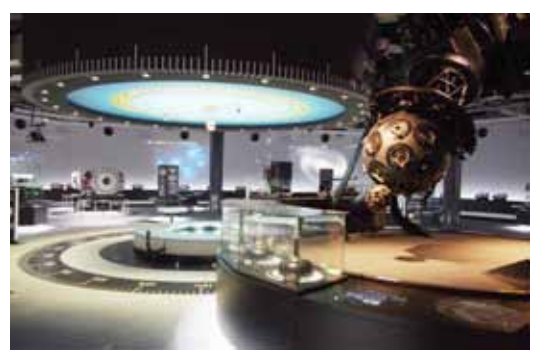
Experience the wonders of nature Large exhibits